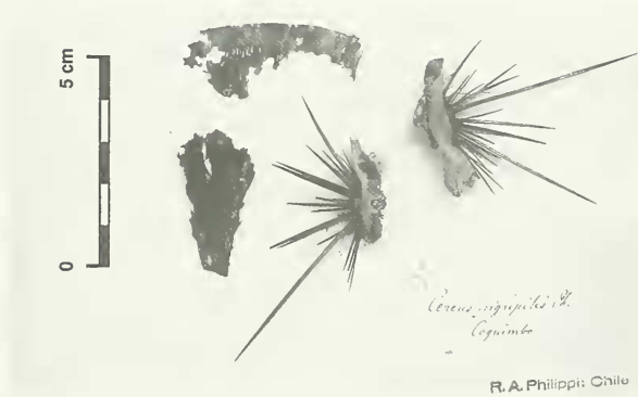
FIGURE 2. Photograph of herbarium sheet of Cereus nigripilis Phil. at HAL (isotype).